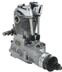
Saito FA-125A 4 Cycle Engine